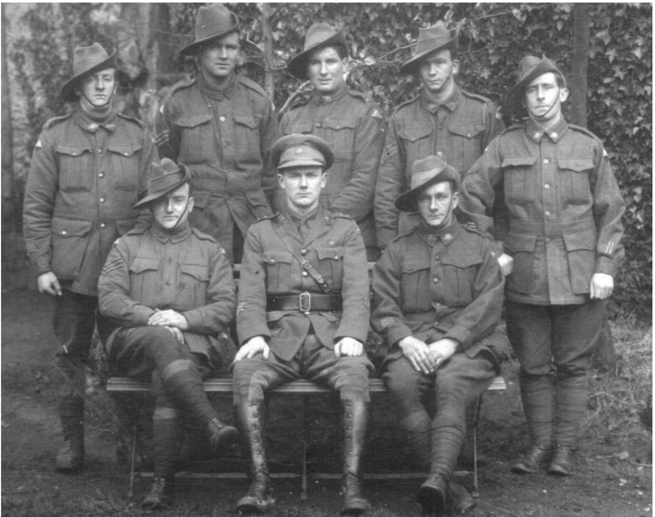
An unnamed group of men from the 24 th Battalion.