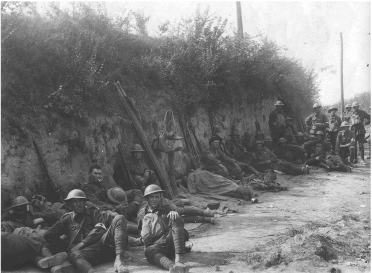
Photo: A group of weary Diggers (infantry and stretcher-bearers) resting in a sunken road. The photo appears to have been taken after a battle, and may be of men from the 33 rd Battalion.